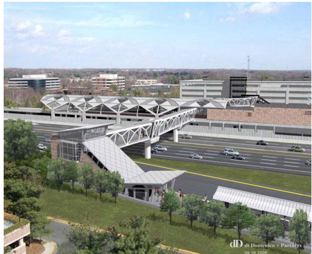
Proposed Wiehle Avenue Metro Stop